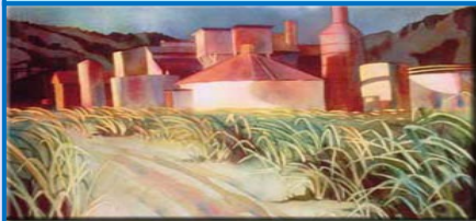
Old Kōloa Sugar Mill Run Nov 09, 2019

Everyone is welcome! Just let us know the numbers.