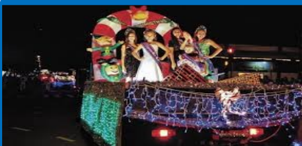
Lights on Rice Street Parade December 6, 2019