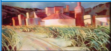
Old Kōloa Sugar Mill Run Nov 09, 2019