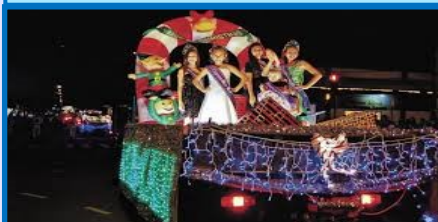
Lights on Rice Street Parade December 6, 2019