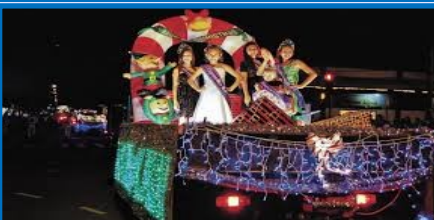
Lights on Rice Street Parade December 6, 2019