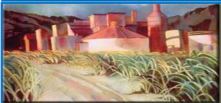
Old Kōloa Sugar Mill Run Nov 09, 2019

Crime Stoppers Kaua`i sent our club a letter for our $1,000 donation to support this program. The funds are used to help the crime stopper's efforts to solve cases from tips received that identify and locate criminals which they forward to law enforcement agencies to make an arrest. Donations fund the Crime Stoppers reward program.