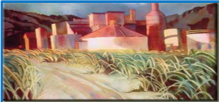
Old Kōloa Sugar Mill Run Nov 09, 2019