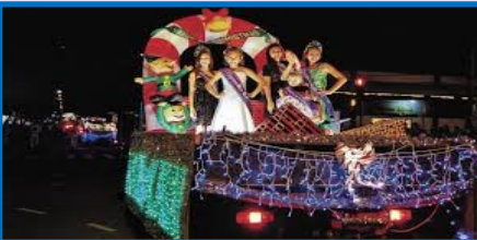
Lights on Rice Street Parade December 6, 2019